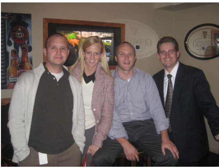
Jones Waldo Team