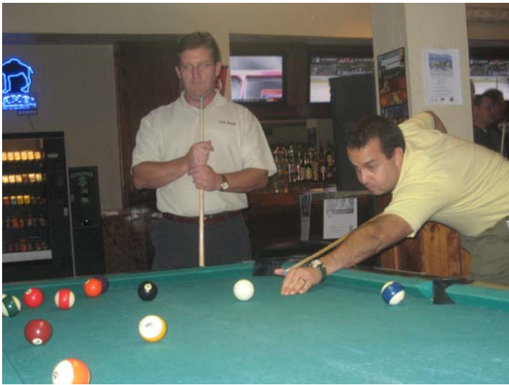
Tournament Action—CIT Bank (presenting sponsor)