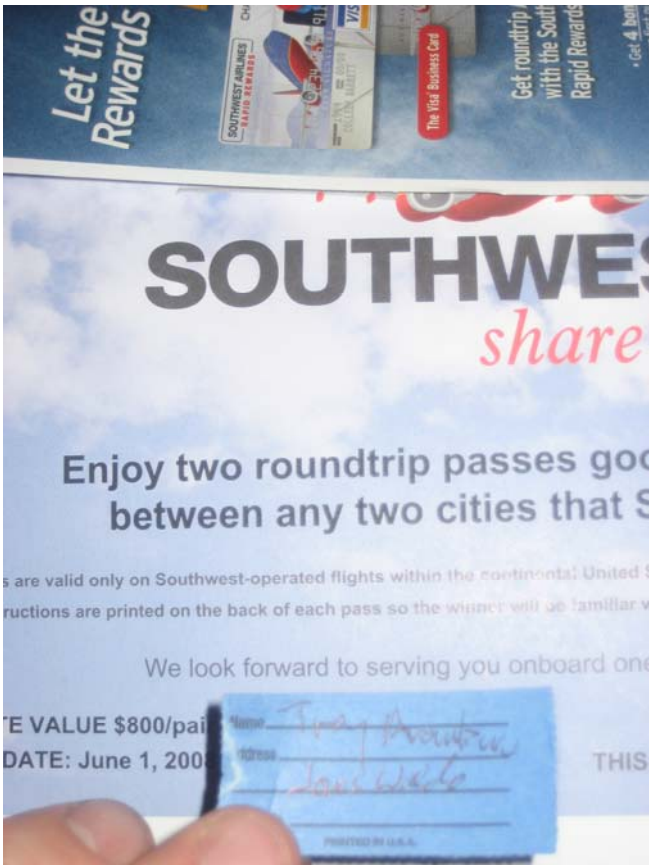
Grand Prize Winning Ticket