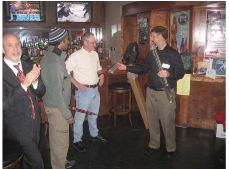
Awarding Tournament Prizes